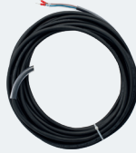
Straight grounding cable up to 30 m