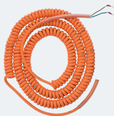
Coiled grounding cable up to 15 m