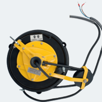
Cable reel up to 10 m